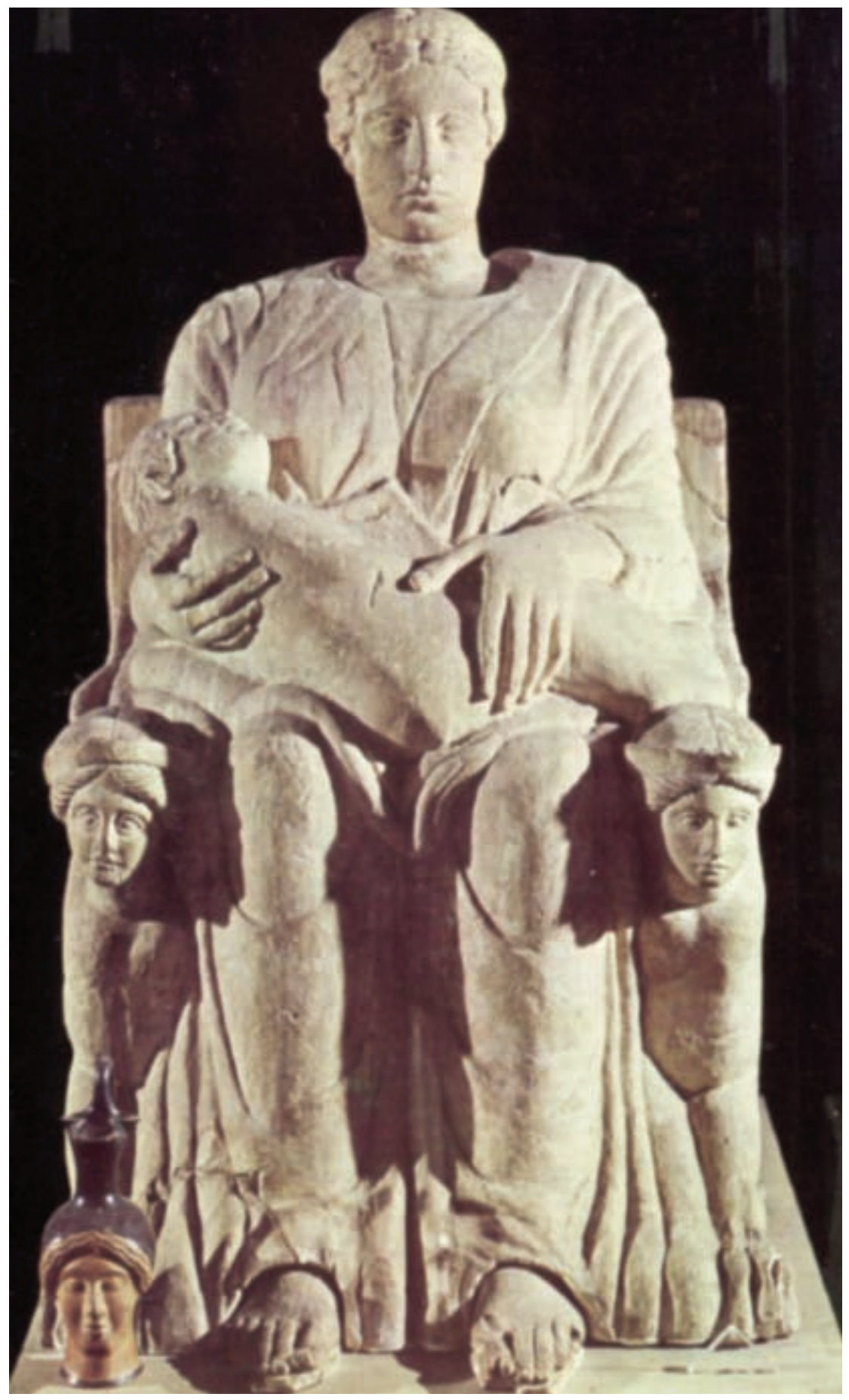
Mater Matuta (Etruscan goddess of maturing grain, death, and human birth)