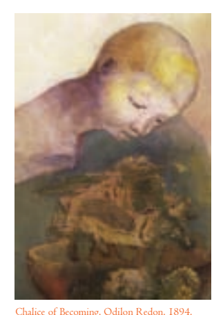
Chalice of Becoming, Odilon private collection

Wakeful consciousness, the daytime ego, must necessarily work with the memory of a dream; what, say, I recall as a dream from last night. Thus dream interpretation has to reckon with the difficulty of memory, that is to say, of time, timing, and human temporality. Implicit in Jung's caution are at least two modes of temporality: oneiric time and that of biography. For Jung, these modes of time belong to different psychic 'levels'. The dreams of early childhood 'are dreamed out of the depth of the personality.' The interpretation of