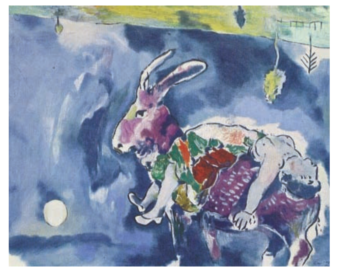
The Dream, Marc Chagall, 1927, courtesy of the Musee Du Petit-Palais, Paris