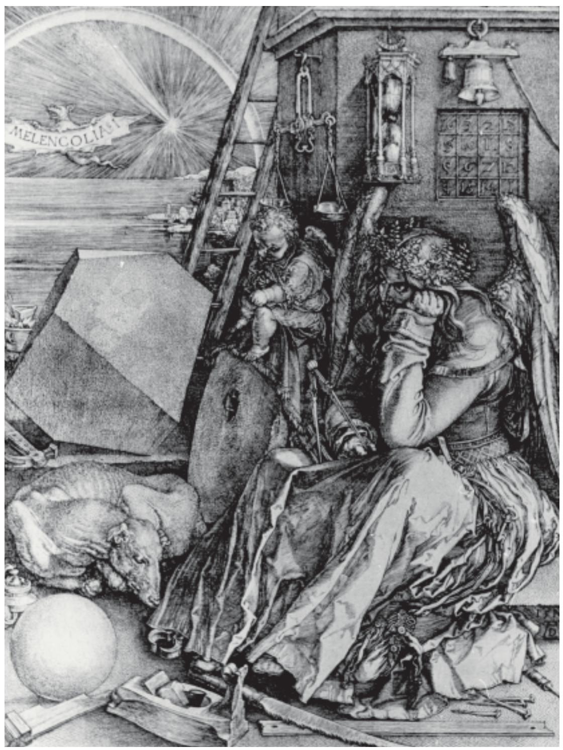
Melancholia I, Durer

clearly in healing processes in which the psyche tries to translate the shock into a psychical anxiety situation, as in the following example: