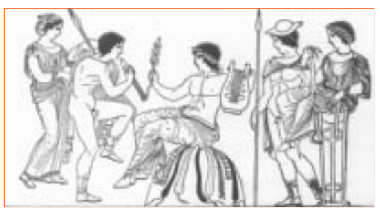
Apollo on the Delphic omphallos

the ones called "great dreams" by the primitives. They are like an oracle, "somnia a deo missa."<sup>1</sup> They are experienced as illumination.