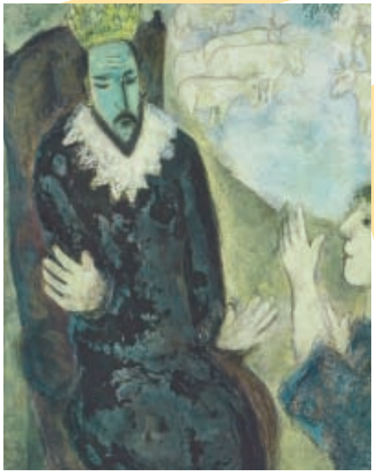
Joseph and Pharaoh, Marc Chagall

This example shows you that dreams can be sufficiently explained by an exclusively objective method, without personal associations.