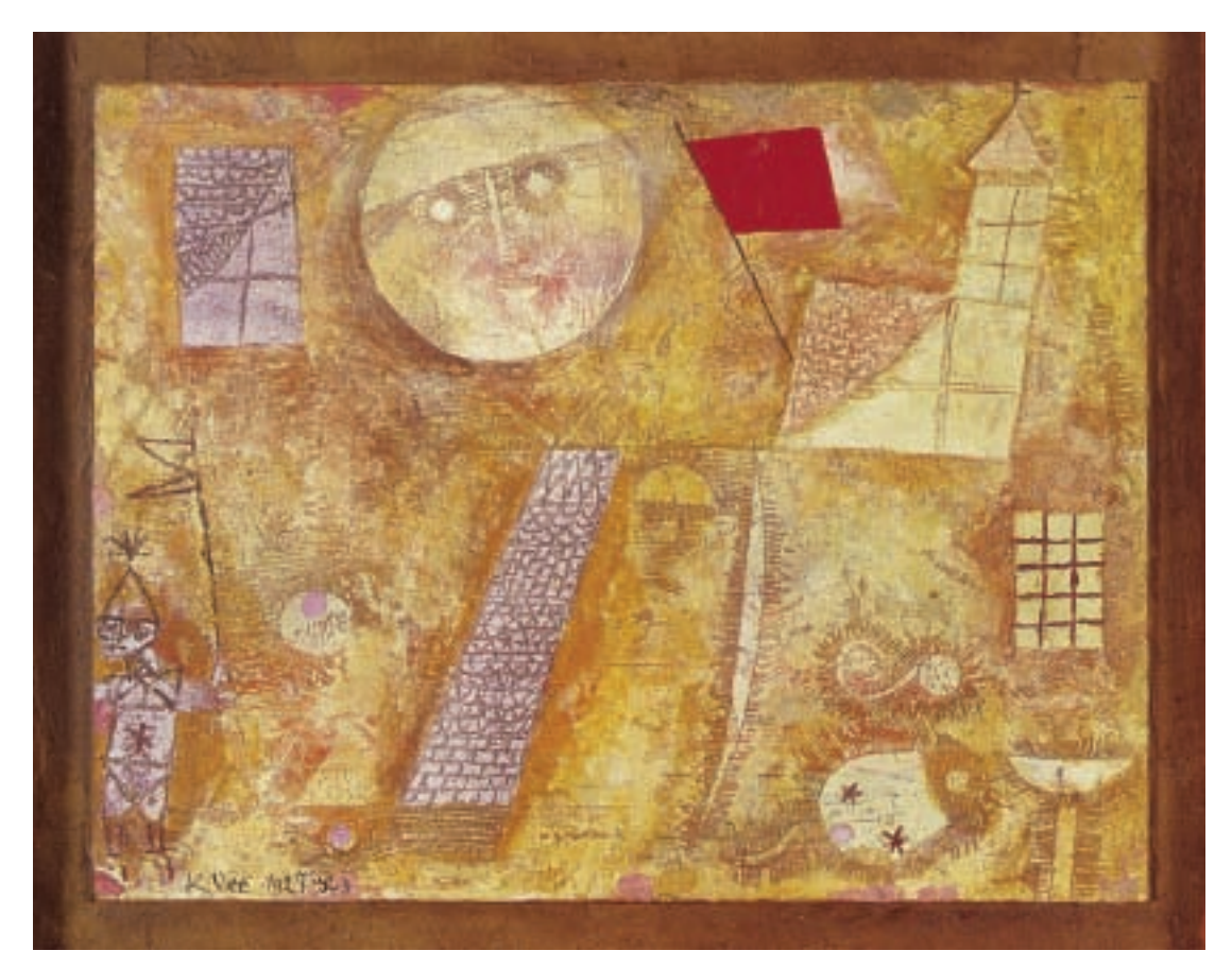
Full Moon, Paul Klee, 1927, private collection

cultures of depth psychology requires a process of translation. But translation from what into what? Jung recognizes the profound uncertainty, including the question of temperament (the 'personal equation') in interpreting any dream. Therefore he proposes that the interpreter needs to investigate dreams by way of a 'dream series'. By such means, Jung suggests, we may offset to some extent the interpreter's subjective bias, namely, the underlying complexes both of the individual hermenaut and the dream psychology by which he or she approaches the dream. The dream series is meaningfully connected, the underlying 'monologue', 'as if', says Jung, the dreams were trying to give 'expression to a central content from ever varying angles.' Thus, having carefully, attentively, followed the dream series, 'the whole describes a certain line.